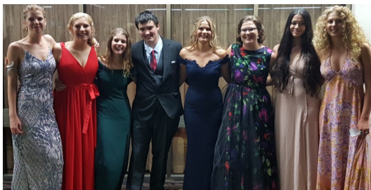
2017 Y12 RRHC Formal