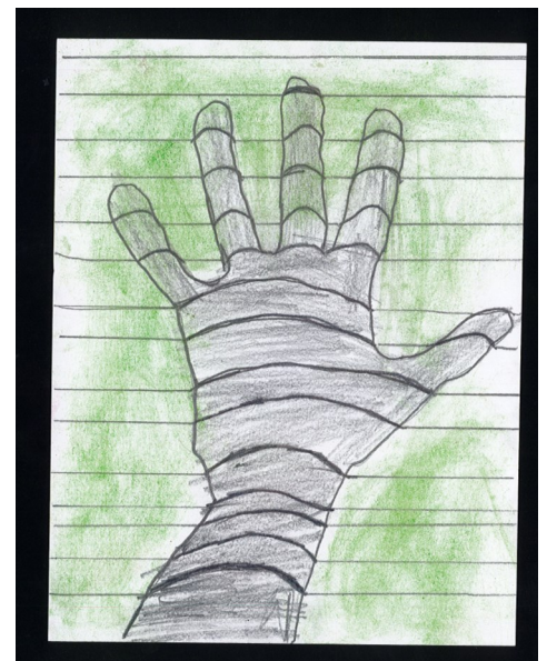
CAPA work sample by Beau