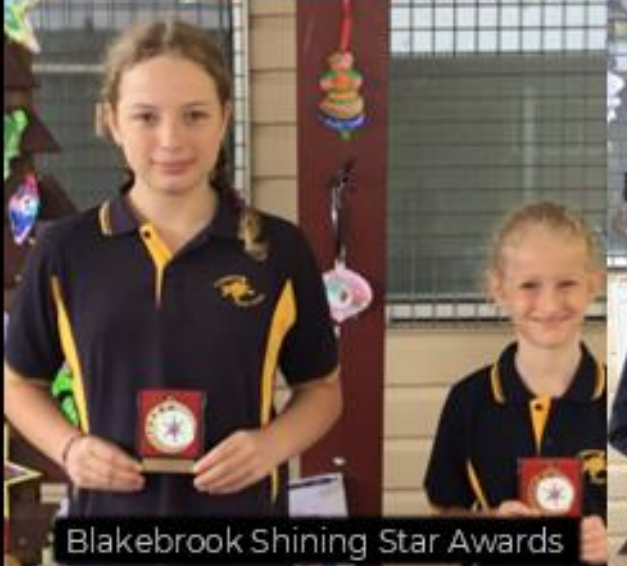
Blakebrook Shining Star Awards