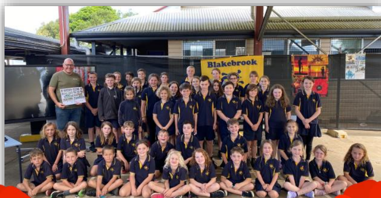
Remembrance Day Assembly with special guest Lismore Mayor Steve Krieg