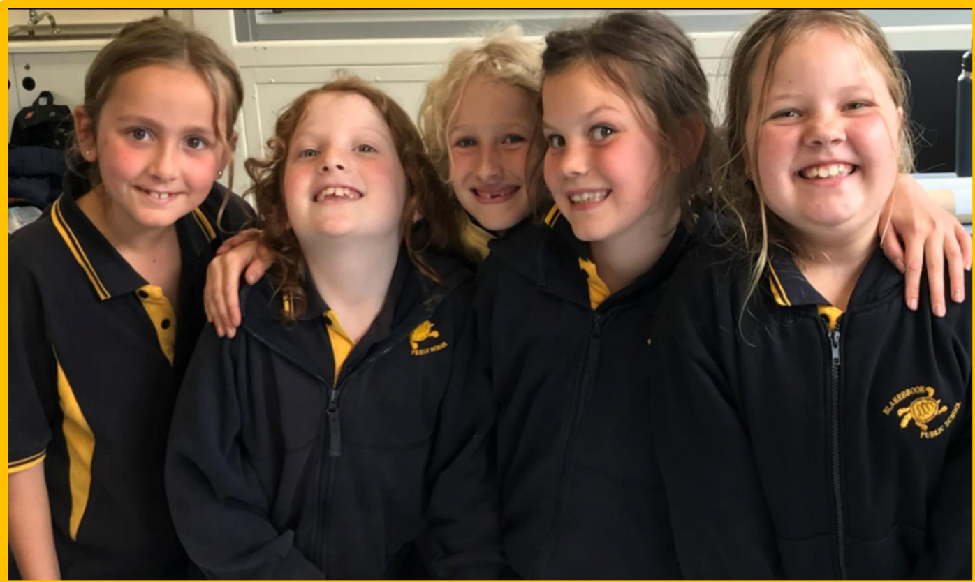
First Week back at Blakebrook