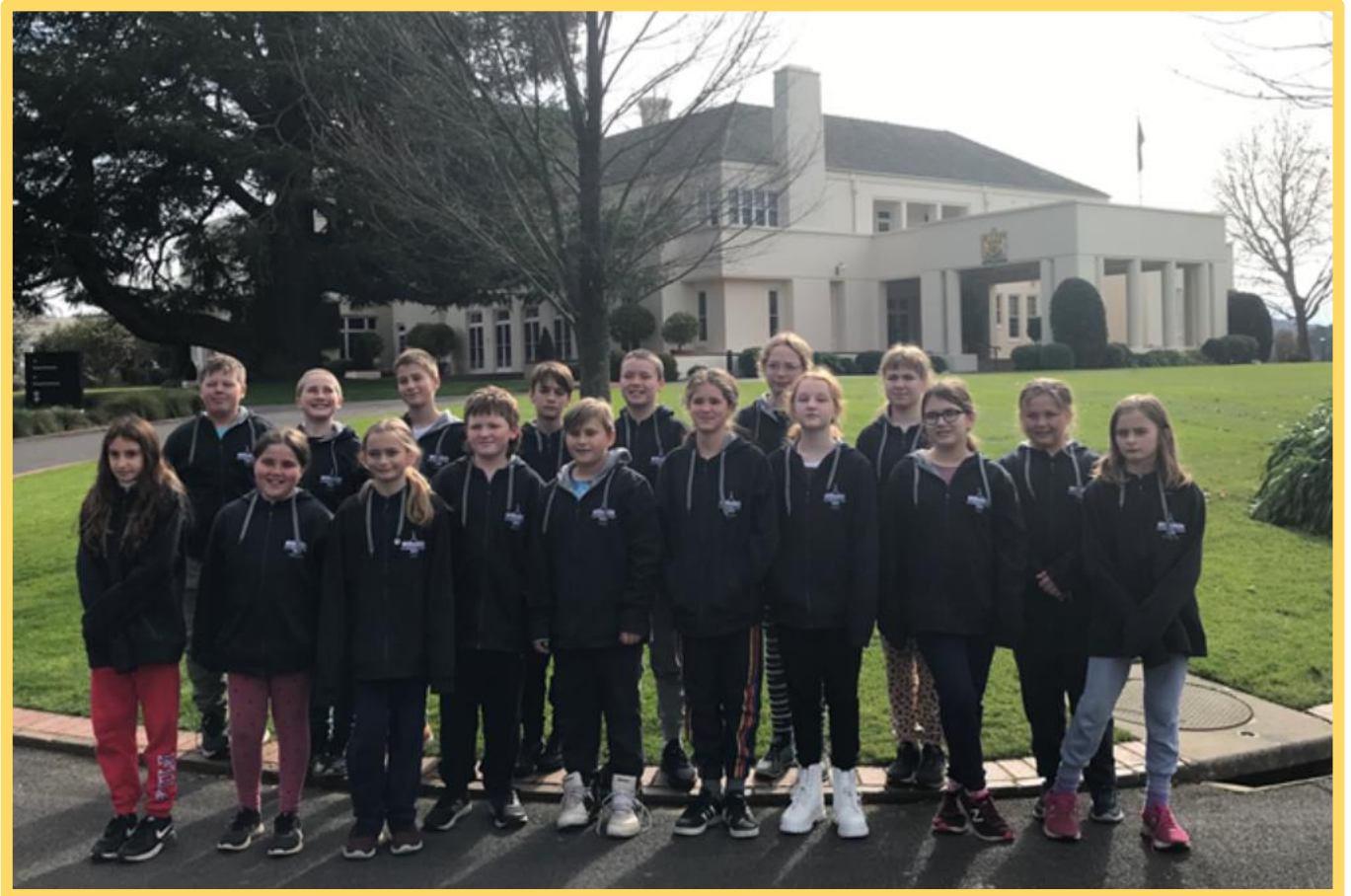
Enjoying Hot Milo and toast